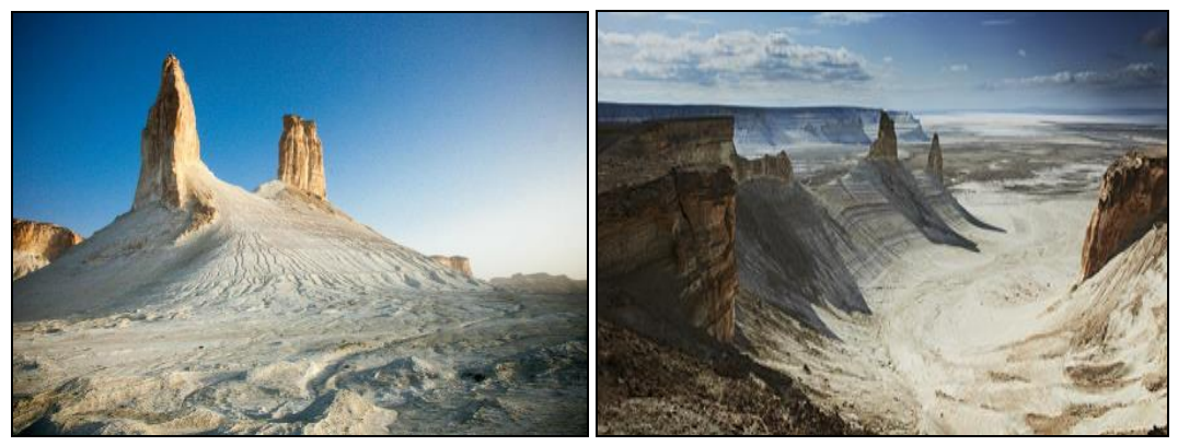
Figure 7. Boszhira Geomorphosite

Outlier mountains-chameleons also formed here, changing their appearance depending on the position of the sun and the time of day, a mountain-yurt, rocky gorges with steep walls, eroded chalk strata, stone nodules. At the bottom of the hollow you can find petrified shells and teeth of ancient sharks. A feature of Boszhira are two limestone peaks, about 300 meters (287 m) high, nicknamed for their form the "Azu Tister", translated from the Kazakh "Fangs of Ustirt". The peaks are cut by small ravines and beams, between which there is a narrow path along which you can climb to the observation deck from which a wide view of the Boszhira valley opens.