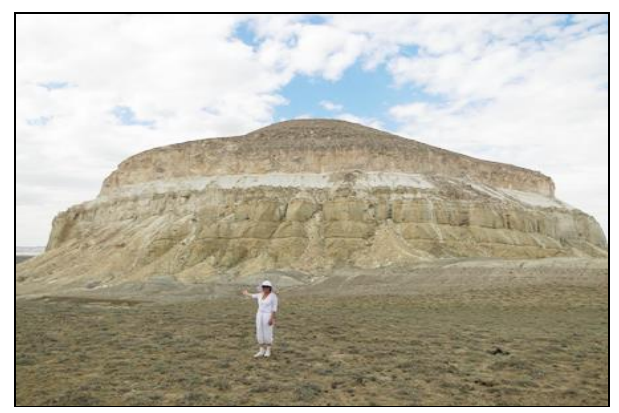
Figure 2. Mount Sherkala Geomorphosite

Mount Sherkala Geomorphosite . The territory of the geotope Mount Sherkala is located about 170 kilometers from the city of Aktau, 18 km from the village (Figure 2).