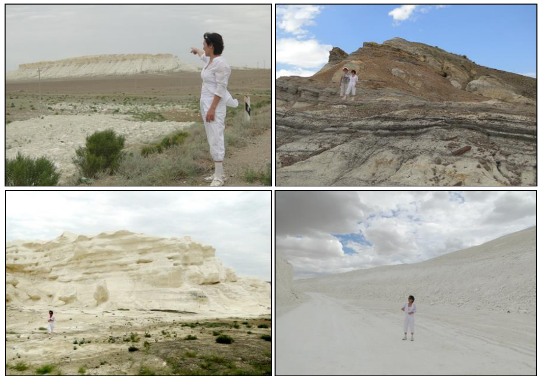
Figure 4. Mountain Mangyshlak Geomorphosites

Mangushlak Mountain is represented by low ranges of the North and South Aktau. Western and Eastern Karatau. The Karatau ridges are composed of dislocated mudstones, schists, Permo-Triassic limestones and conglomerates sandstones. represented by large ridges with leveled or slightly wavy peaks and steep, sharply dissected slopes (Bekzhanov et al., 2000). The ranges are facing the Karatau valleys and rise above them by 100-200 m. The highest point of the town of Beshoky is 556 m, in East Karatau, Deposits of greenish clays at the foot merge with vellowish, pink, reddish clays or snow-white chalky outcrops; above they turn into vellowish-brown Sarmatian limestones. All of this is represented by a unique, layered formation, because the strata of deposits of unequal density and are susceptible to erosion in different ways (in particular, the layering of rocks is clearly visible on the coast). In Northern Aktau there is a unique place called "Akespe" (Figure 4). It is also called the "chess valley" because of the location of the rocks. The area is distinguished by a peculiar whiteness due to stacked rocks: limestones, marls and snow-white clays. Due to wind erosion, a typical type of relief has formed here, giving the area a beautiful landscape. The peaks of low snow-white mountains are cut by ravines and hollows. In the spring, during rain, stormy streams run along them, sometimes demolishing roads and settlements.