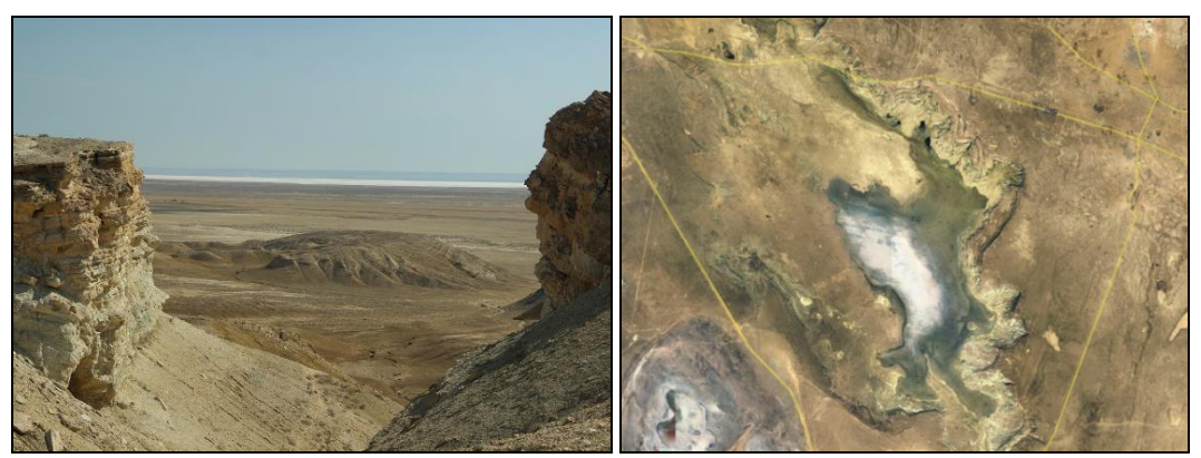
Figure 5. Karakiya Basin Geomorphosite

of this part is covered mainly with sand. Litter is located at the bottom of the cavity, the descent to which is hampered by deep steep and winding ravines. The Eastern slope of the basin is high and cut through by deep ravines. According to local tradition, a long time ago there was a lake on this place, which was called "Batyr" - "Brave Warrior". The lake gradually dried up and a hollow formed. Locals still call basin as the "Batyr" basin. The formation of a basin is associated with the leaching of salty rocks, with subsidence and karst processes (Aristarkhova, 1970). The karst is based on the erosive and dissolving activities of groundwater. Underground water seeping to the bottom of the cracks found in limestone, dolomite and gypsum, gradually dissolved the rocks, expanded them, developed deep and narrow abysses (Kondybai, 2007).