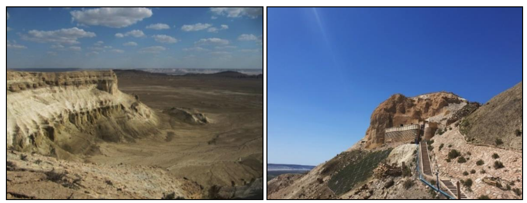
Figure 6. Ustirt chinks and the Becket Ata necropolis

of 21 kilometers from North to South and 9 kilometers from East to West. Boszhira's cosmic landscapes are composed of limestone deposits, once the bottom of the ancient Tethys Ocean, which existed over 10 million years ago. The huge valley-hollow is surrounded on three sides by an "amphitheater" of various landforms of white Cretaceous rocks - canyons, peaks, mountain-towers, mountain-castles (Figure 7).