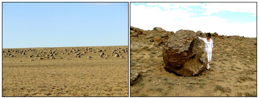
Figure 3. Torysh Geomorphosite

Shetpe to the north-west. In morphological terms, the table remains with a complex gully-relief relief. Mount Sherkala is a lonely standing mountain, of a very unusual shape. If you look at it from one side, the mountain looks like a huge white yurt